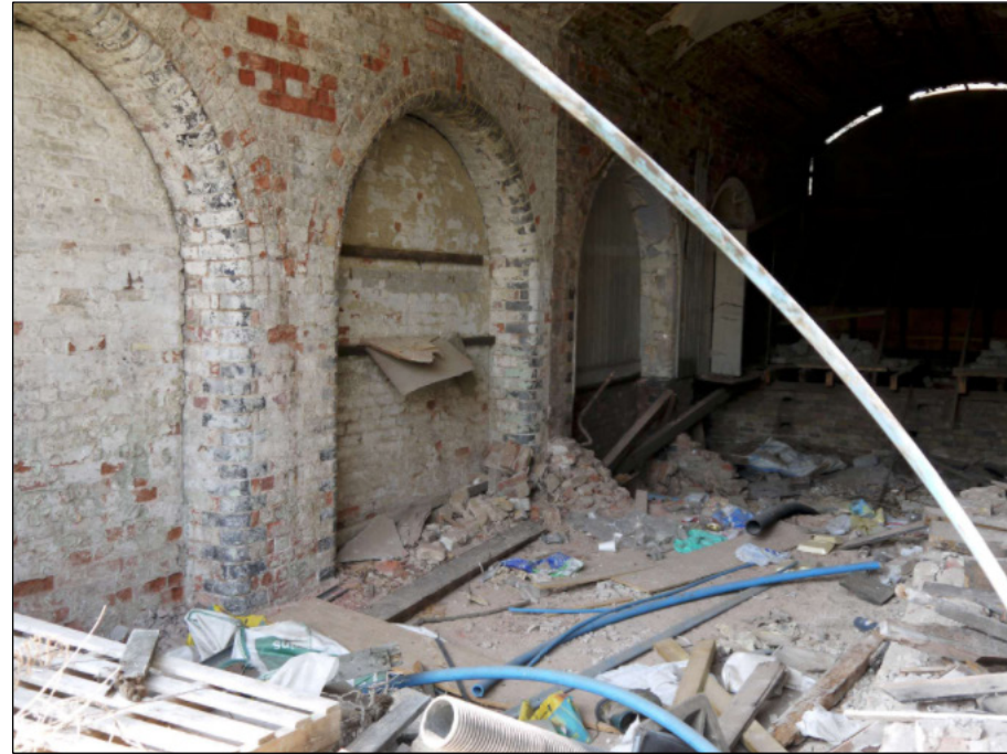
VIEW INSIDE SURVEYED VAULT CONTAINING CROSS ARCHES