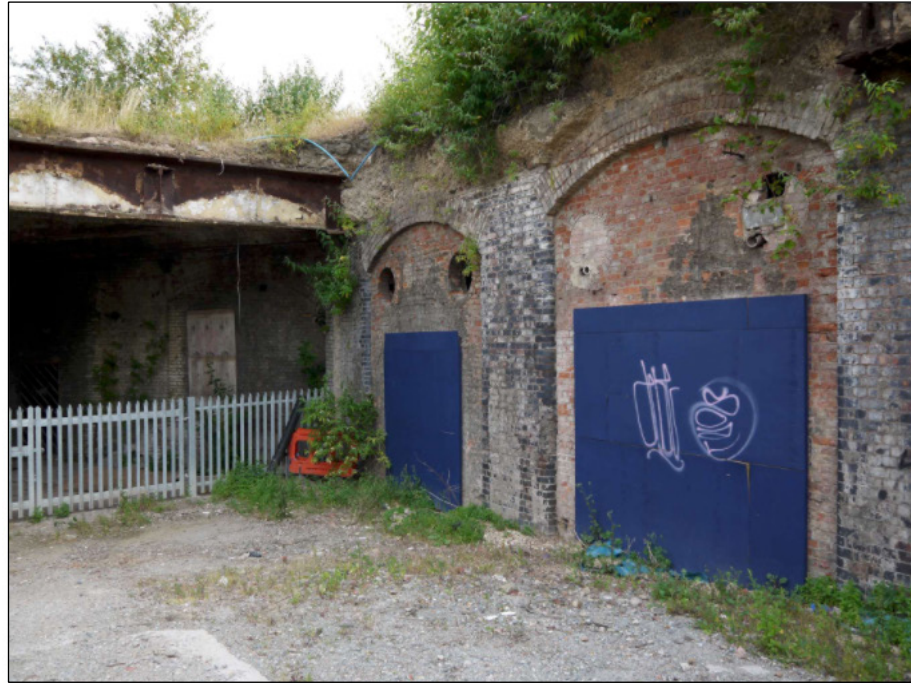
VIEW OF EAST ELEVATION OF VAULTS CONTAINING CROSS ARCHES - Vaults to be opened up and rubble excavated to enable existing cross arches to be surveyed.