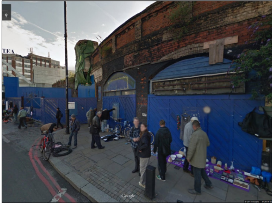
COMMERCIAL ST. VIEW OF WEST ELEVATION OF VAULTS CONTAINING CROSS ARCHES - Vaults to be opened up and rubble excavated to enable existing cross arches to be surveyed.