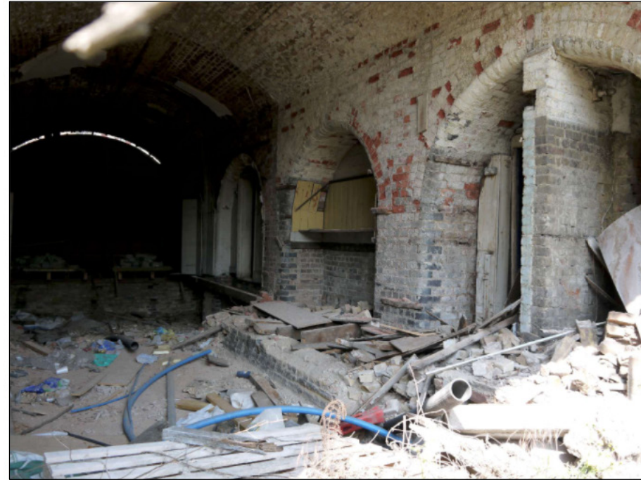
VIEW INSIDE SURVEYED VAULT CONTAINING CROSS ARCHES